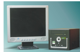
GreenX Dimensions: 25.4 X 20.32 X 19.05 cms wt.: 3 kgs.

Accessories shown are not a part of GreenX and are subject to change without any prior notification.